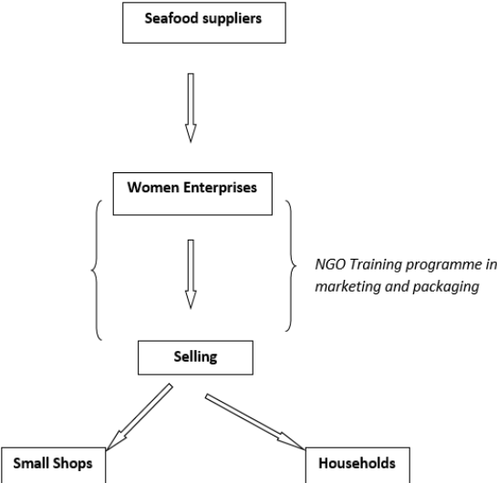
Figure 2. NGO A intervention in the market structure of shrimp paste

The production technique before the product is finally ready to sell is long and complicated. The women spend most of the time in the production and selling process. They are the sole beneficiaries of the activity. Furthermore, they trade their product either to local shops or at home. The clients are mainly the villagers who come to their house to purchase the final product. The buyers are usually familiar people already known by the women entrepreneurs.